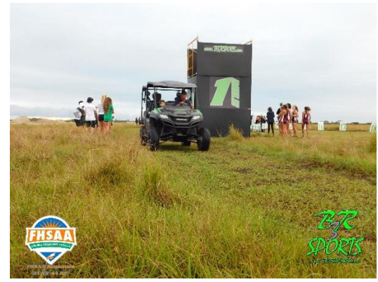
Follow Us On @b3r_sports

We have custom mile markers as well as meter markers. Video boards at each mile marker with a run time and Horses at each Meter marker.