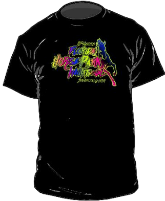
$20 event t-shirt