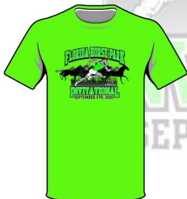
$20 event t-shirt